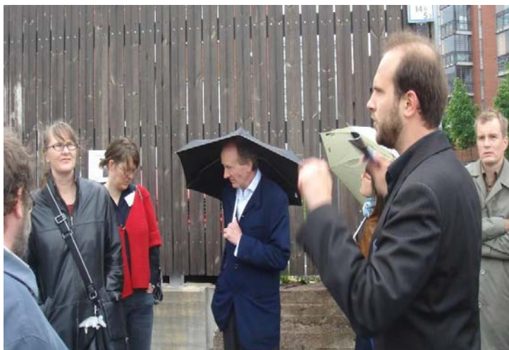
First CoP meeting with local planning practitioners at Helsinki on June 15, 2009.

A sample set of indicators, as they have been so far decided in the CoPs, is presented in the following table. The final set of indicators will be validated with datasets available and will be incorporated into the DSS to spatially assess the environmental impacts and the socio-economic implications of different urban planning alternatives on the basis of energy, water, carbon and pollutants fluxes.