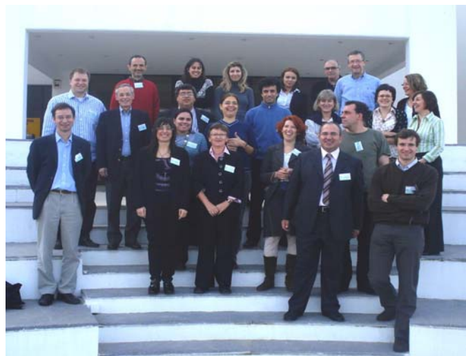
Participants of the kick-off meeting held at Heraklion on January 22-23, 2009.

The minutes of each meeting are available on the BRIDGE ftp server: http://www.iacm.forth.gr/egroupware .